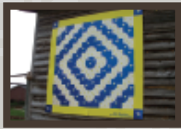
2. Drunkard's Path Dwayne and Penny Sidden 10421 Longbottom Road, Traphill, NC