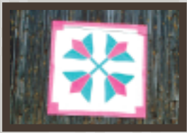
1. Tulip Velma Rohla Sparta Road (North) at the intersection of Yellow Banks Rd, N. Wilkesboro, NC