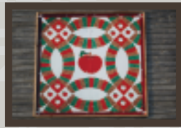
3. Double Wedding Ring Mathis Brothers Farm Visible from US Hwy 421 just east of Red, White, and Blue Road exit.